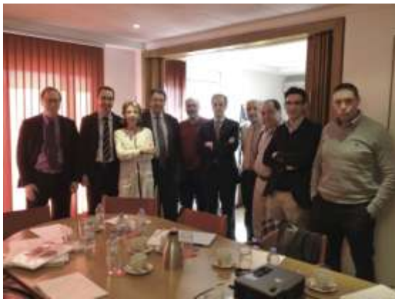
The VAD working group of the SECTCV

During the meeting on February 22 of the VAD working group of the “Sociedad Española de Cirugía Torácica-Cardiovascular” (Spanish Cardiovascular Society, or SECTCV), the